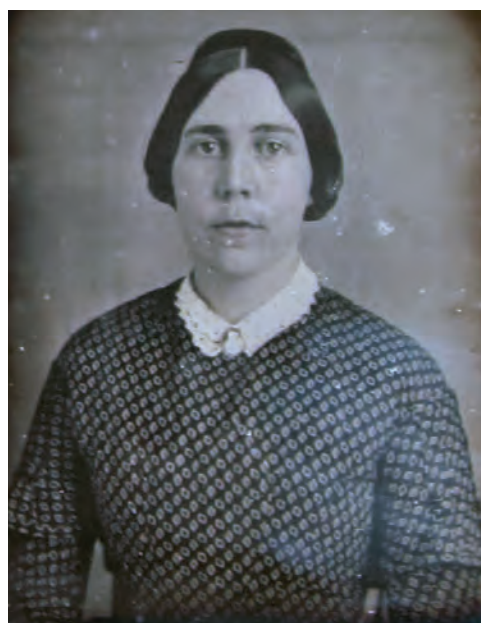
Sophia Thoreau, Concord Museum Collection

The Concord Museum is the one place where all of Concord's remarkable past is brought to life through artifacts from the Museum's outstanding collection, rarely-seen images, period room settings, audio presentations, and creative hands-on activities. Highlights include: "Why Concord?" – six history galleries accompanied by a film, Exploring Concord ; A nationally-significant collection of decorative arts, featuring Concord-made clocks, silver and furniture; Native American stone tools; The 1775 lantern ordered by Paul Revere to be hung in the church steeple and made famous by Longfellow's poem Paul Revere's Ride ; Emerson's study where he wrote his influential essays; The world's largest collection of Thoreau's possessions, including his desk. In addition to the changing exhibitions in the Graham Gund-designed galleries, the Museum features a Museum Shop and a complete year-round calendar of programs for adults and children. concordmuseum.org