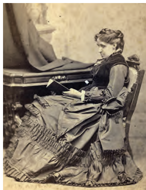
Louisa May Alcott, Concord Museum Collection

On exhibit May 7 through November 7, 2021