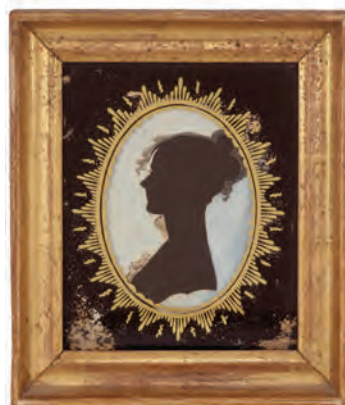
Silhouette, S. (Sarah) Margaret Fuller, Marchioness D'Ossoli (1810-1850), Concord Museum Collection